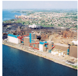
Rio Tinto Iron & Titanium